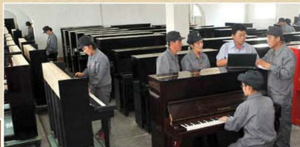
On-the-spot consultative meeting