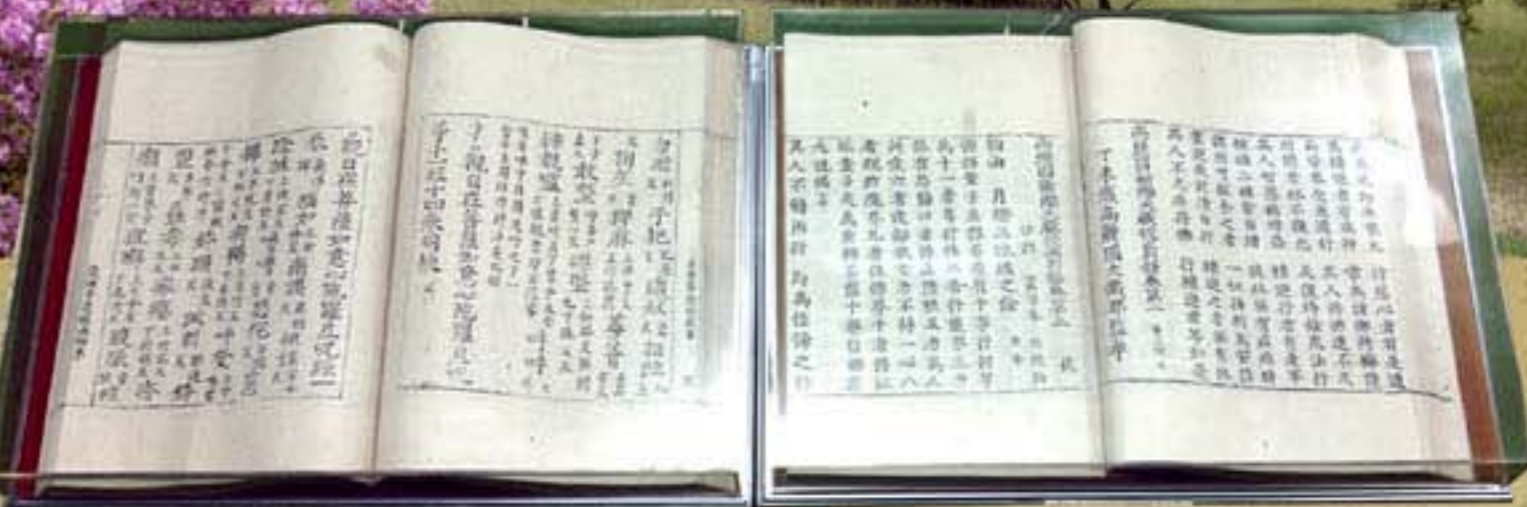
80 000 Blocks of the Complete Collection of Buddhist Scriptures