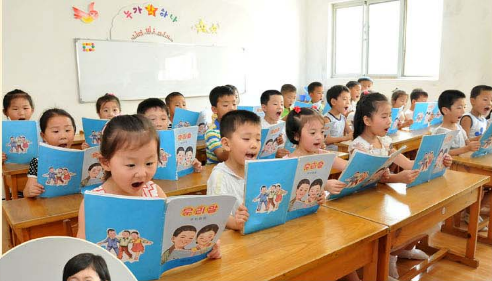
Pre-schooling under smooth way