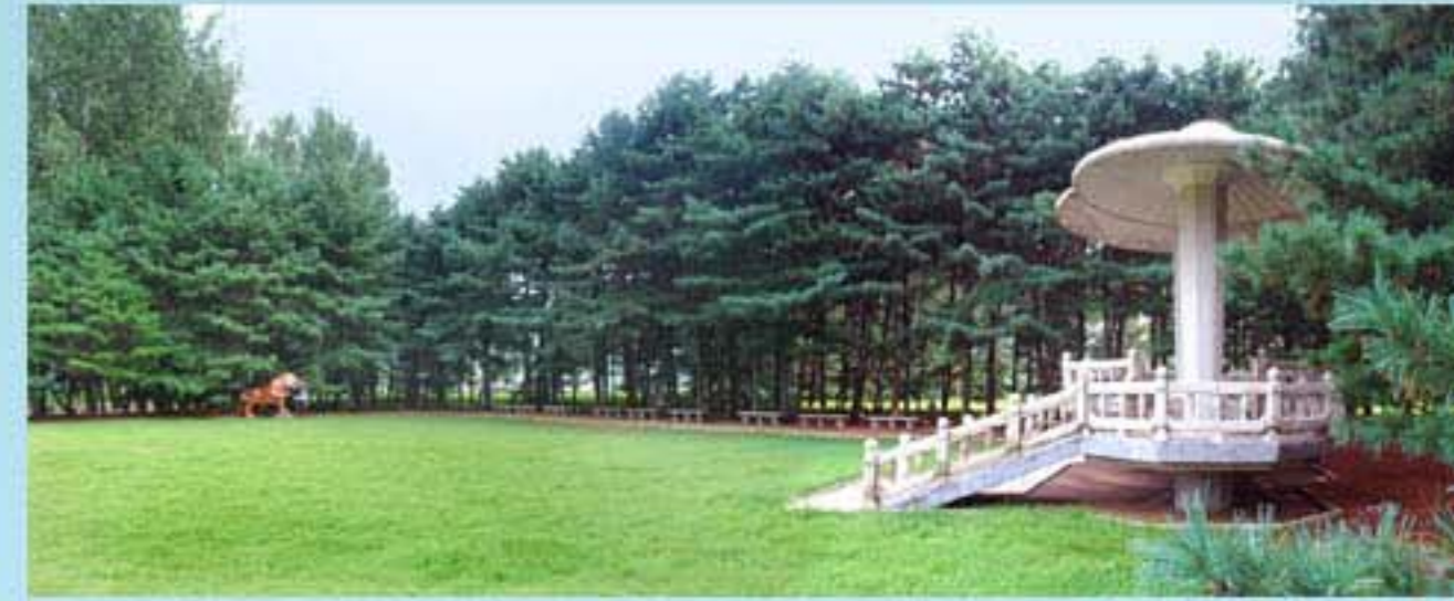
A resting place

Article: Choe Kwang Ho