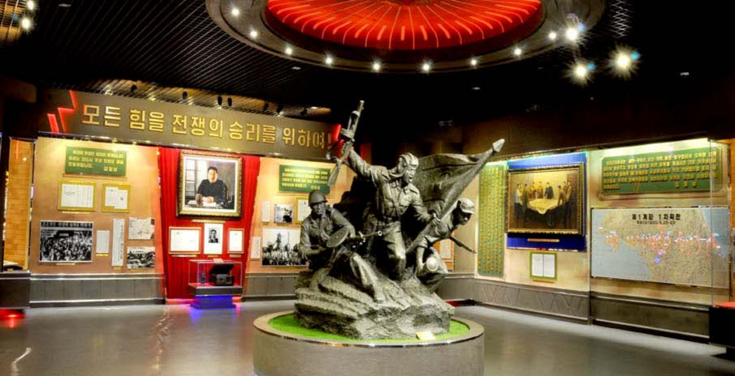
Exhibition halls dedicated to the immortal exploits of the great Generalissimo Kim Il Sung who led the Fatherland Liberation War to victory by putting forth outstanding military ideas and strategies