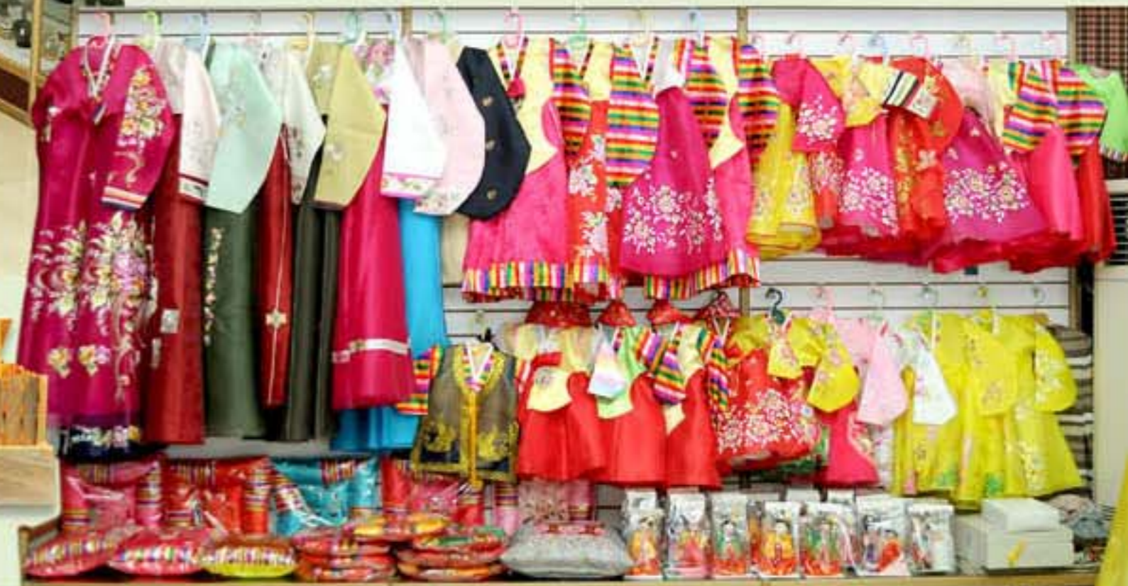
A fine display of folk crafts