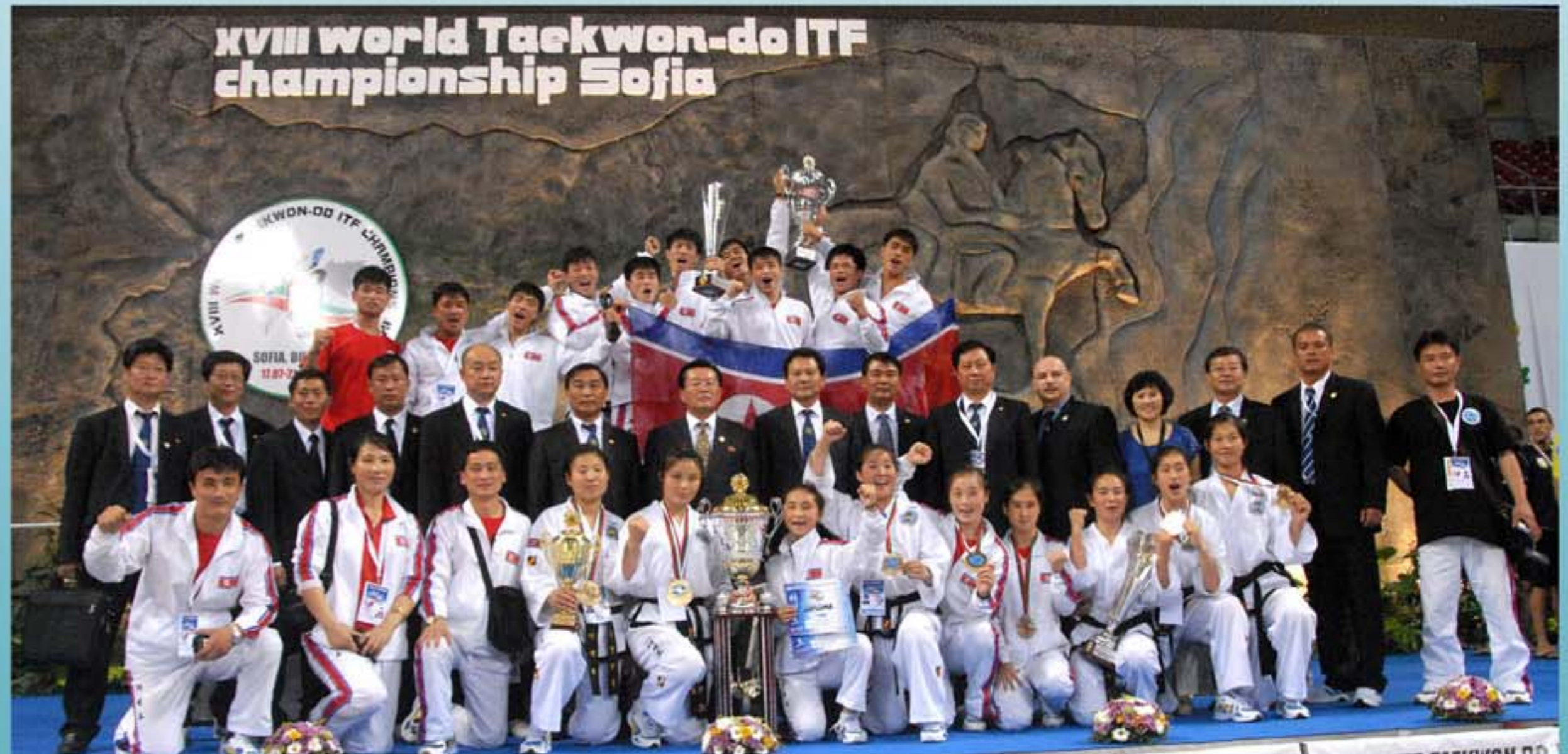
The DPRK takes the first place