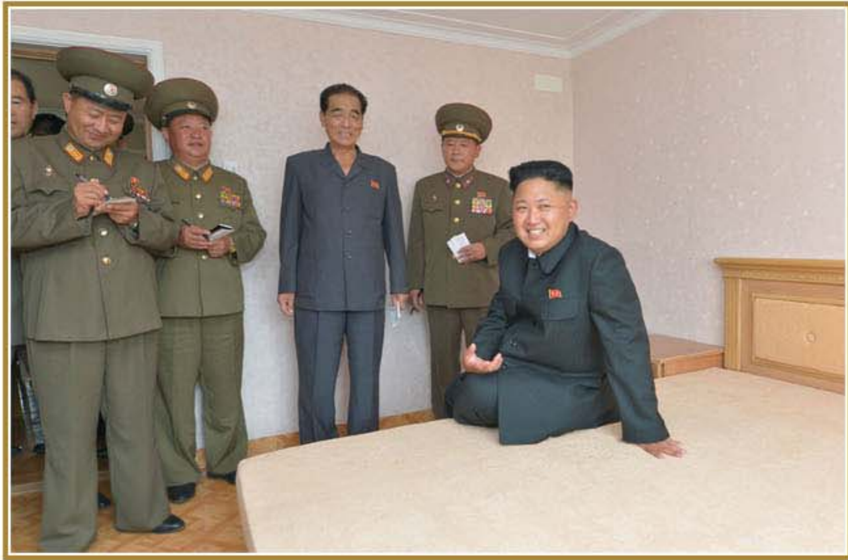
Kim Jong Un looks round the newly built Unha Kwahakja (Scientist) Street