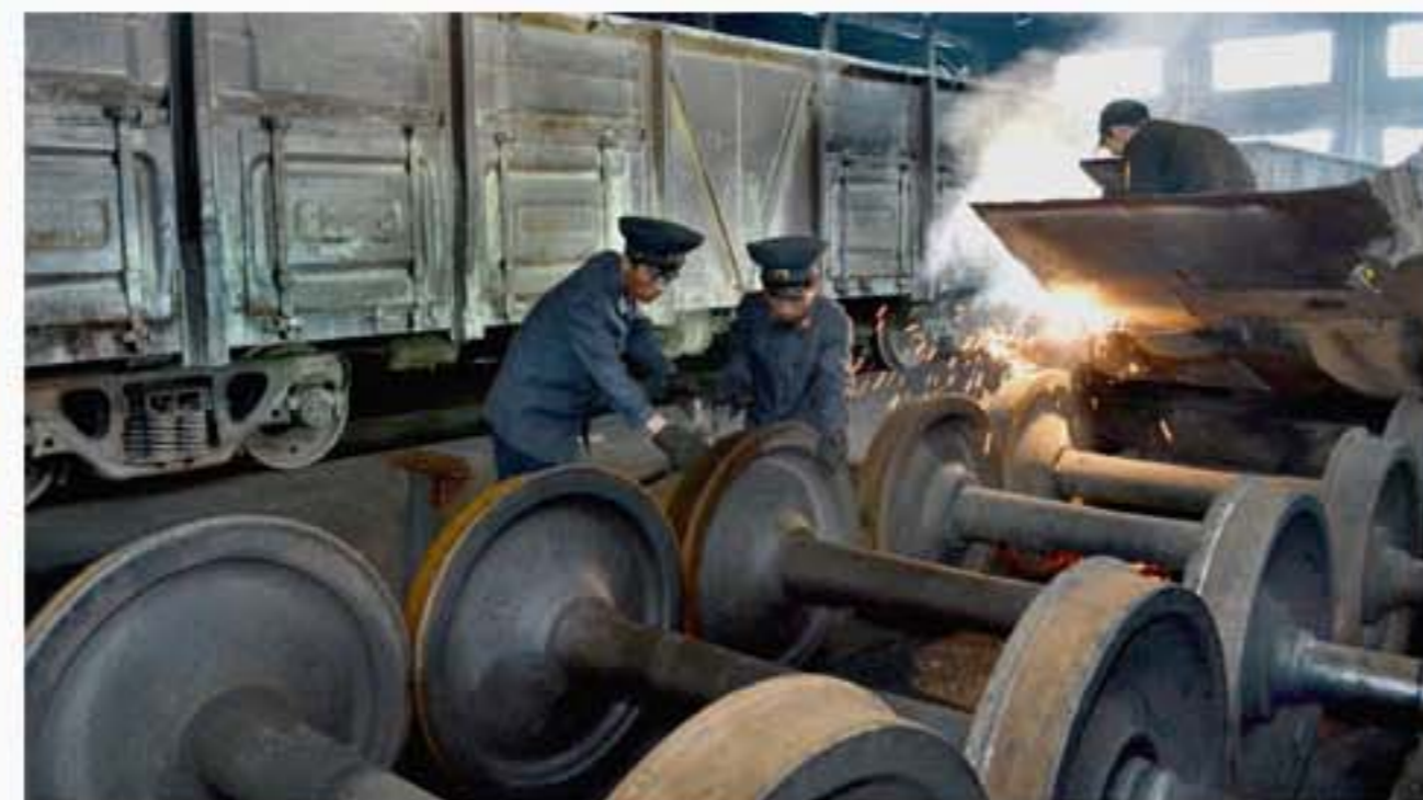
The Passenger and Cargo Carriage Corps under the Pyongyang Marshalling Yard makes innovations in repairing freight cars