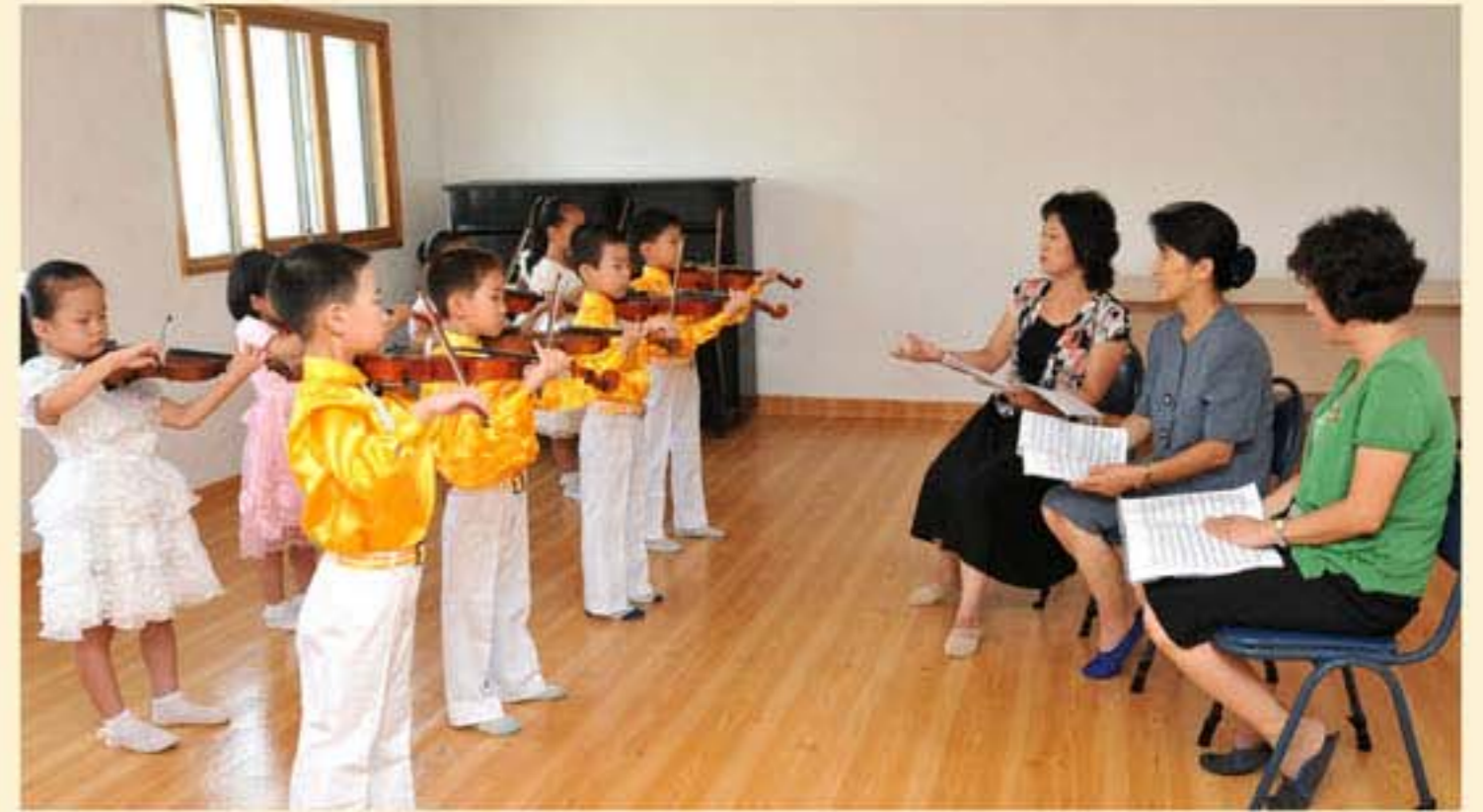
Early artistic education is given to talented children