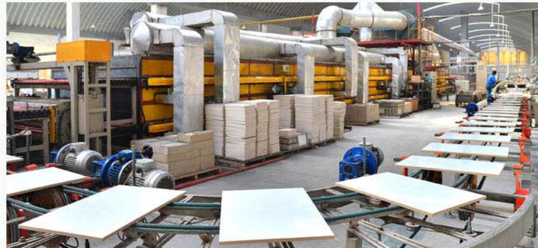
Taedonggang Tile Factory produces quality tiles