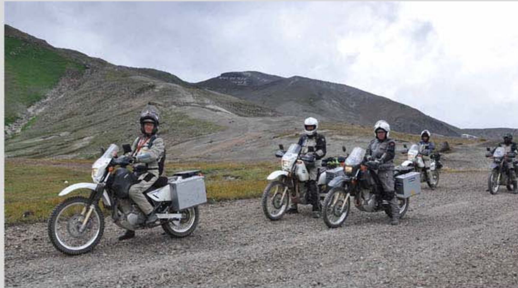
Cyclers from New Zealand leave Mt. Paektu

The head of the group said the purpose of its tour