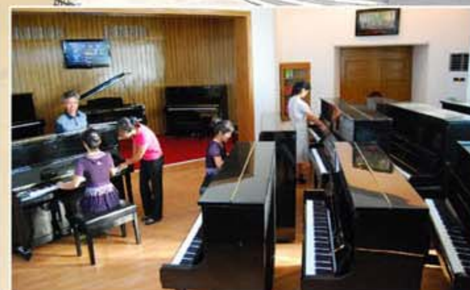
Pianos on exhibition