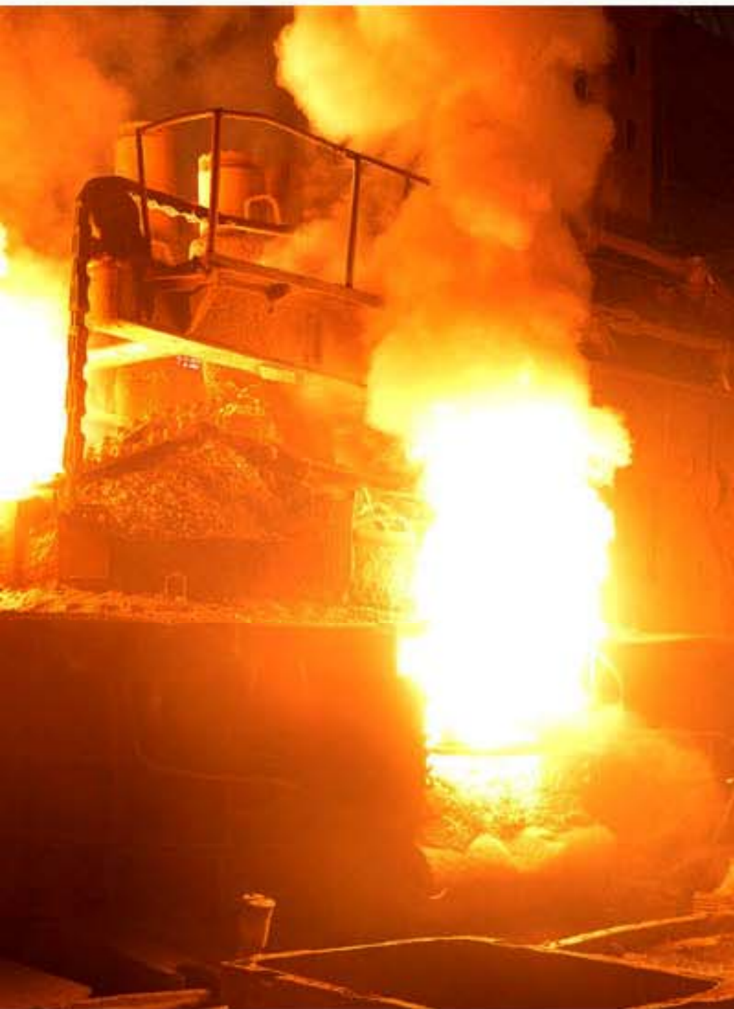
Steel production at the Chollima Steel Complex