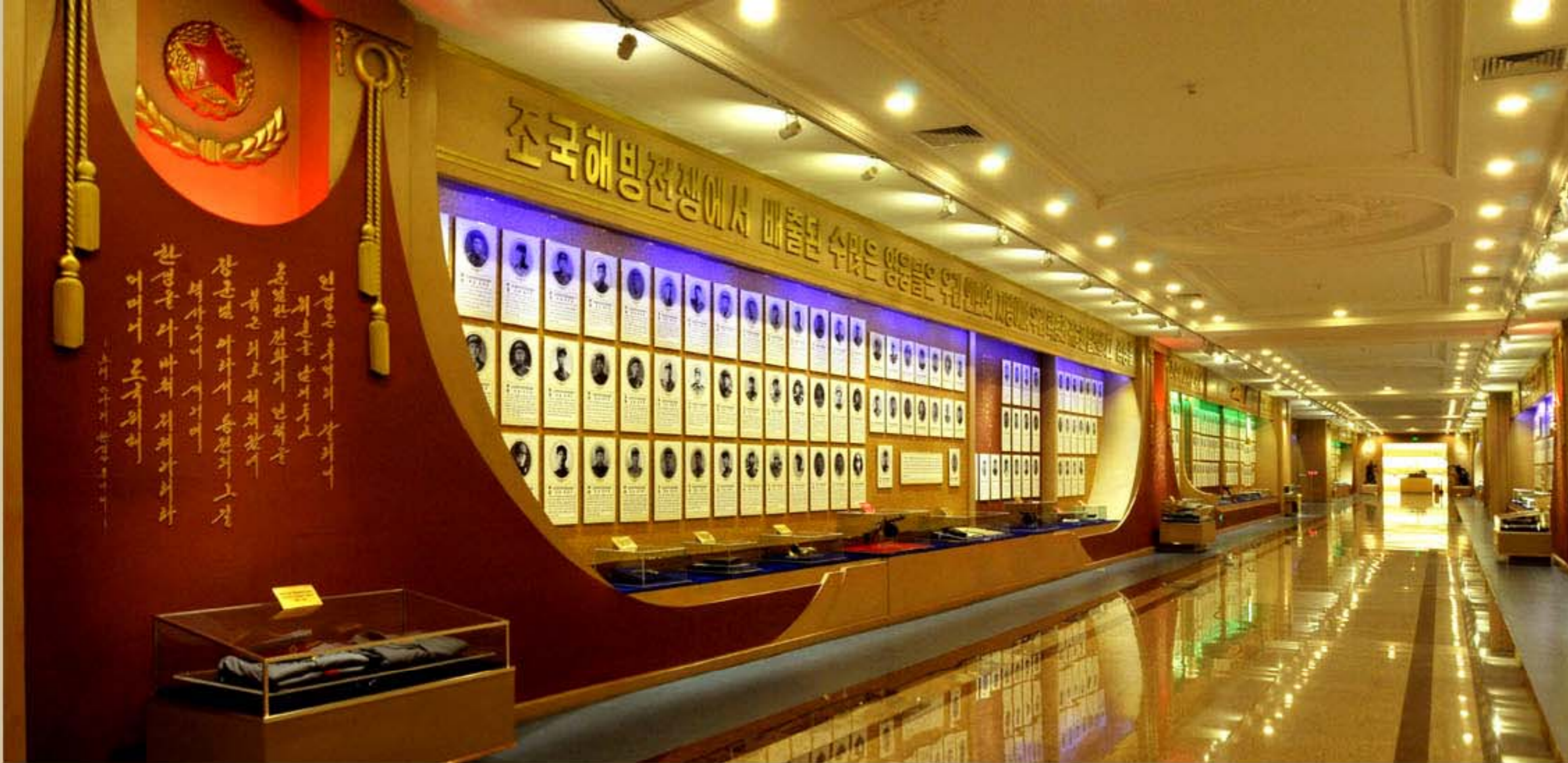
Hall dedicated to war heroes