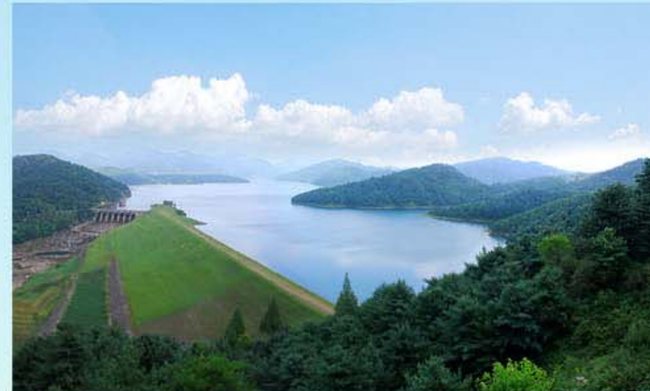
Yonthan Power Station No. 1 the county built on its own