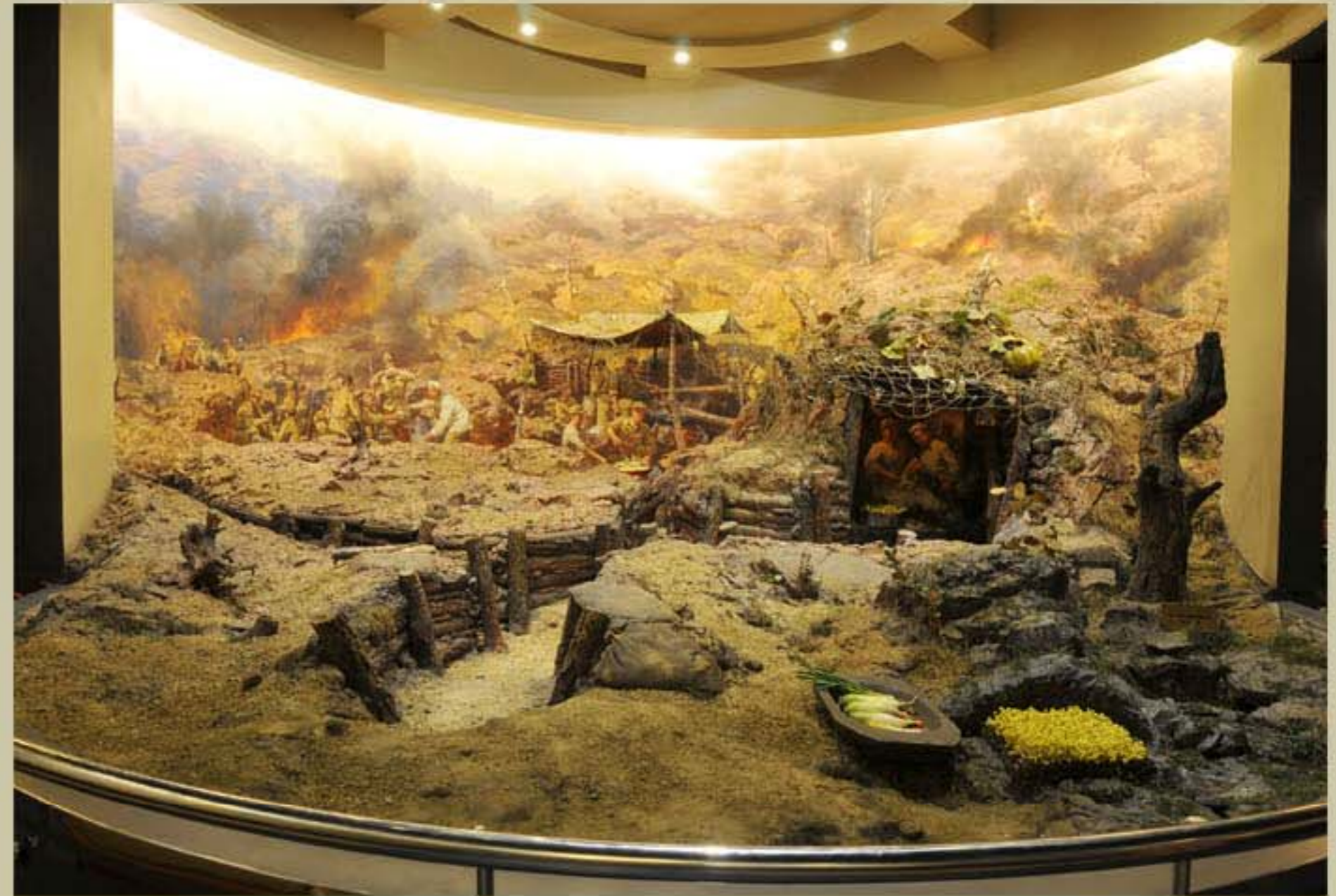
Materials on the struggle of the services, arms and specialized units