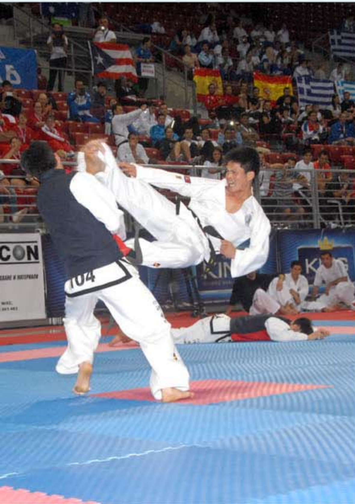
Scene from a male self-defence match

The 18 th Taekwon-Do World Championships was held in Bulgaria in July 2013, which drew hundreds of Taekwon-Do practitioners from over 70 countries and regions across the world.