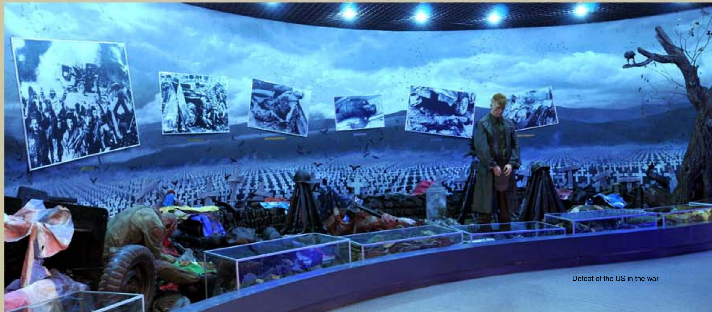
Defeat of the US in the war