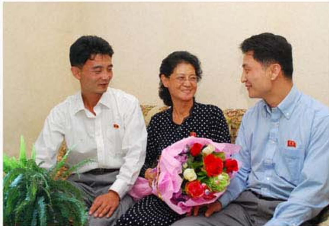
With her sons