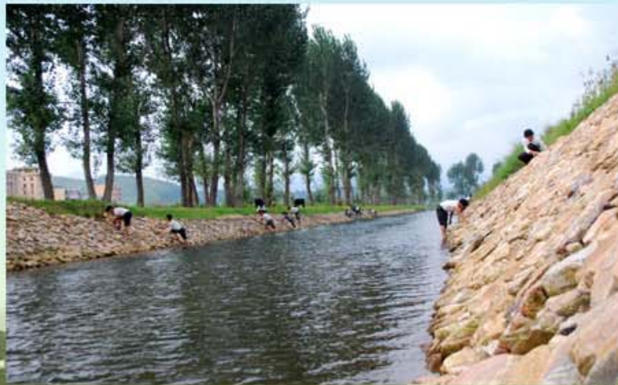
Efforts are made to improve the rivers and streams

Yonthan County is situated among Pongsan, Sohung and Suan counties in North Hwanghae Province. It is not so large in area, mostly surrounded by mountains and has a history of some 60 years, short as compared with the abovementioned counties with a long period of existence. Yonthan means many rapids as fast as swallows.