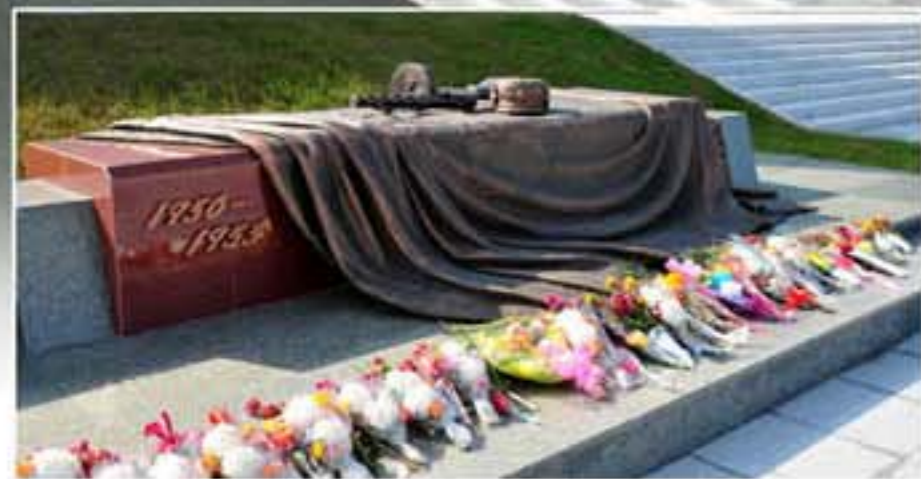
Wreath-laying stand "Souls of Heroes"

Constant streams of Korean People's Army service personnel, Pyongyang citizens and students visit the Fatherland Liberation War Martyrs Cemetery which was inaugurated last July. The cemetery is located in Sosan-dong, Sosong District, Pyongyang.