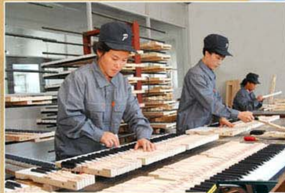
Pianos are produced by qualified workmanship

Pyongyang Piano Joint Venture Company Limited has steadily developed according to its business strategy and high goals since its founding in February Juche 77 (1988). It produces thousands of upright pianos a year, which satisfactorily meets home demand.