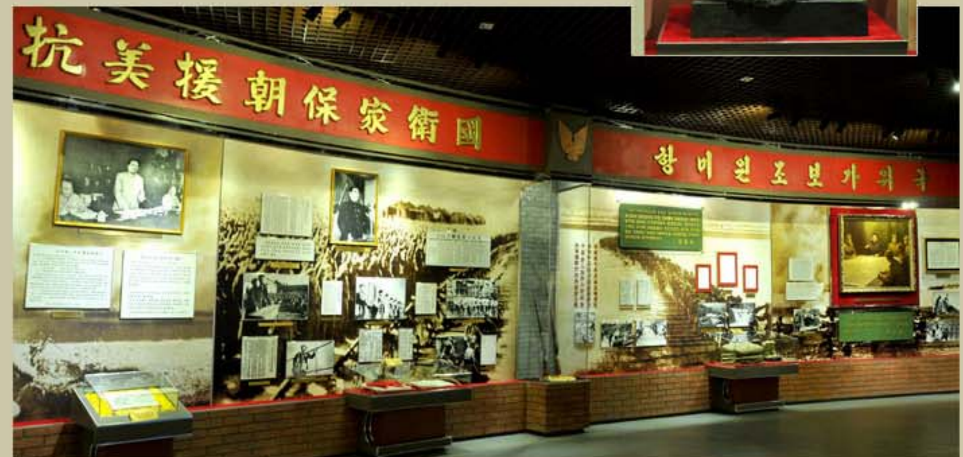
Exhibition hall dedicated to the Chinese People's Volunteers