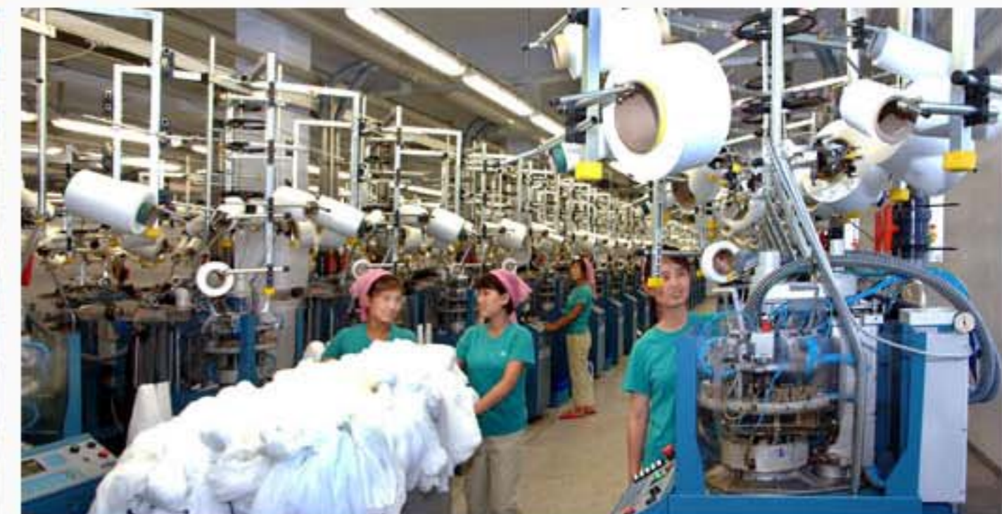
Consumer goods production at Pyongyang Hosiery Factory

In hearty response to the call of the respected Kim Jong Un to usher in a fresh heyday on all the fronts of socialist construction by creating the “Masikryong speed,” the working people in the DPRK are making great boosts in production.