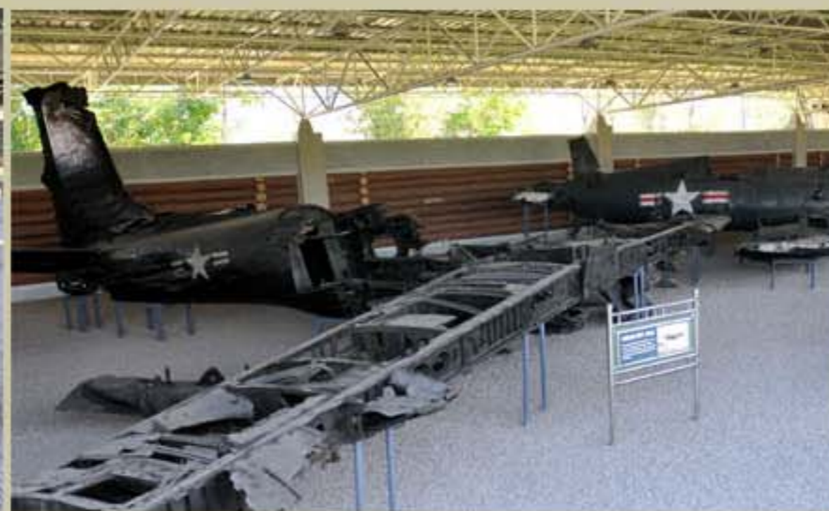
Exhibition hall of the captured weapons