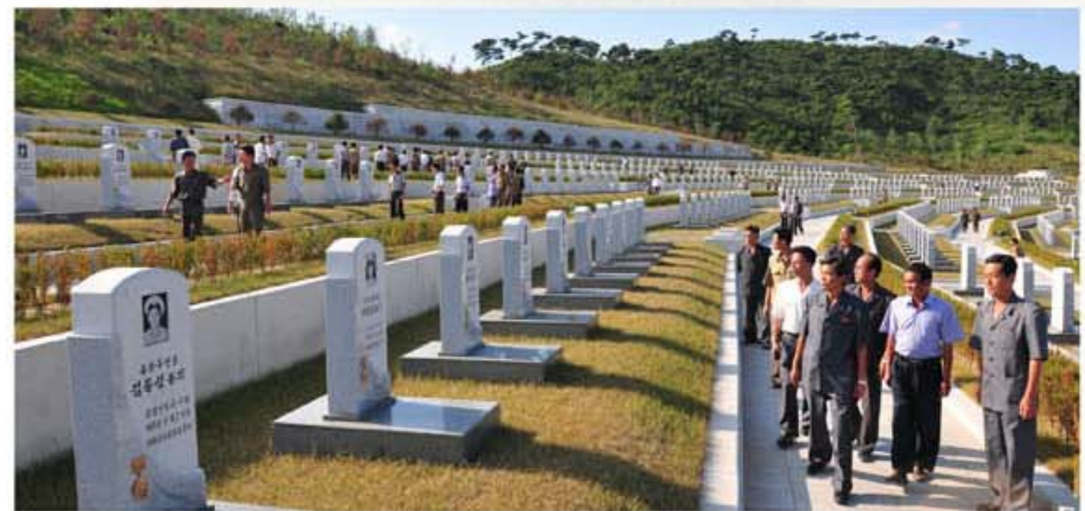
Working people looking round the cemetery