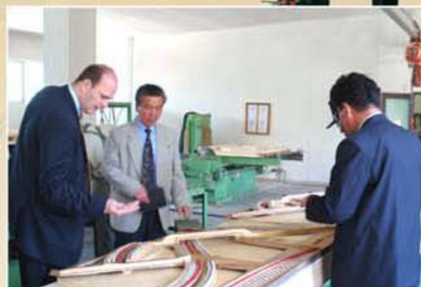
A foreigner examines a piano