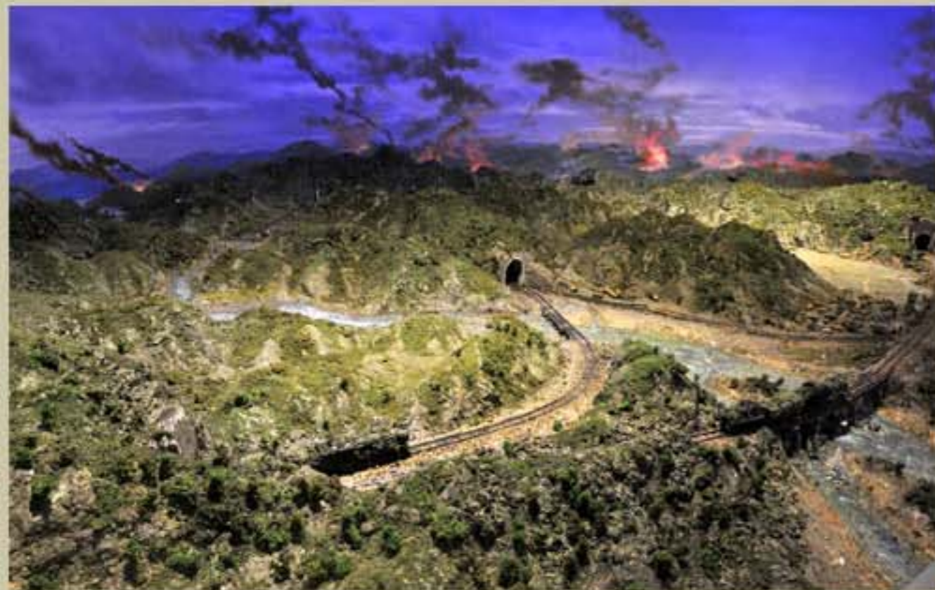
Materials on the wartime transport by the people in the rear