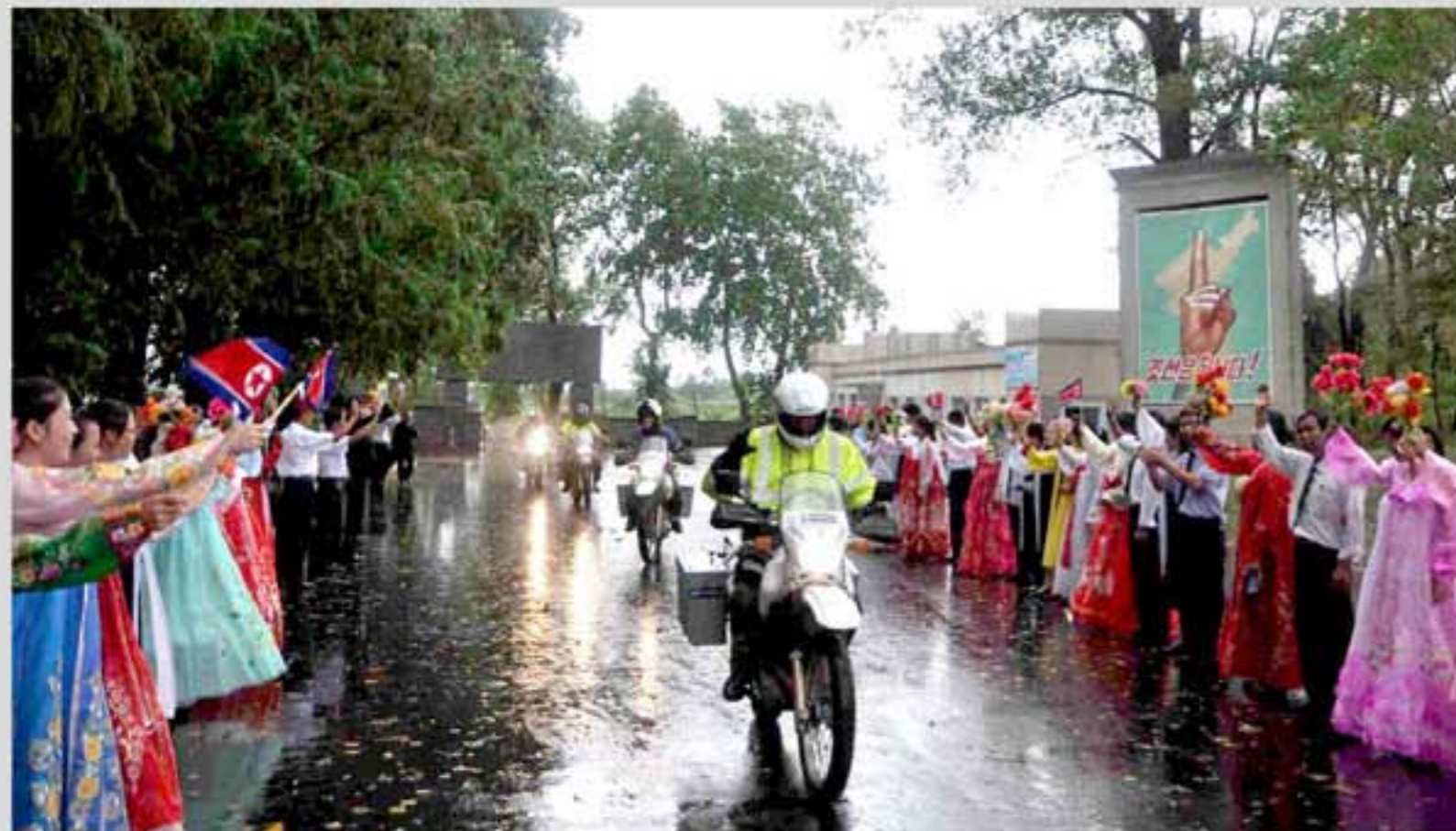
They depart from Kaesong for the Military Demarcation Line

was to show the world that Korea with a long history is a land with one and the same mountain range stretching from Mt. Paektu to Mt. Halla and they would strive to make all the Korean people take such a trip. He continued to say that while staying in the DPRK they were deeply impressed to see the beautiful landscape of Korea and its people making strenuous efforts to build a thriving nation.