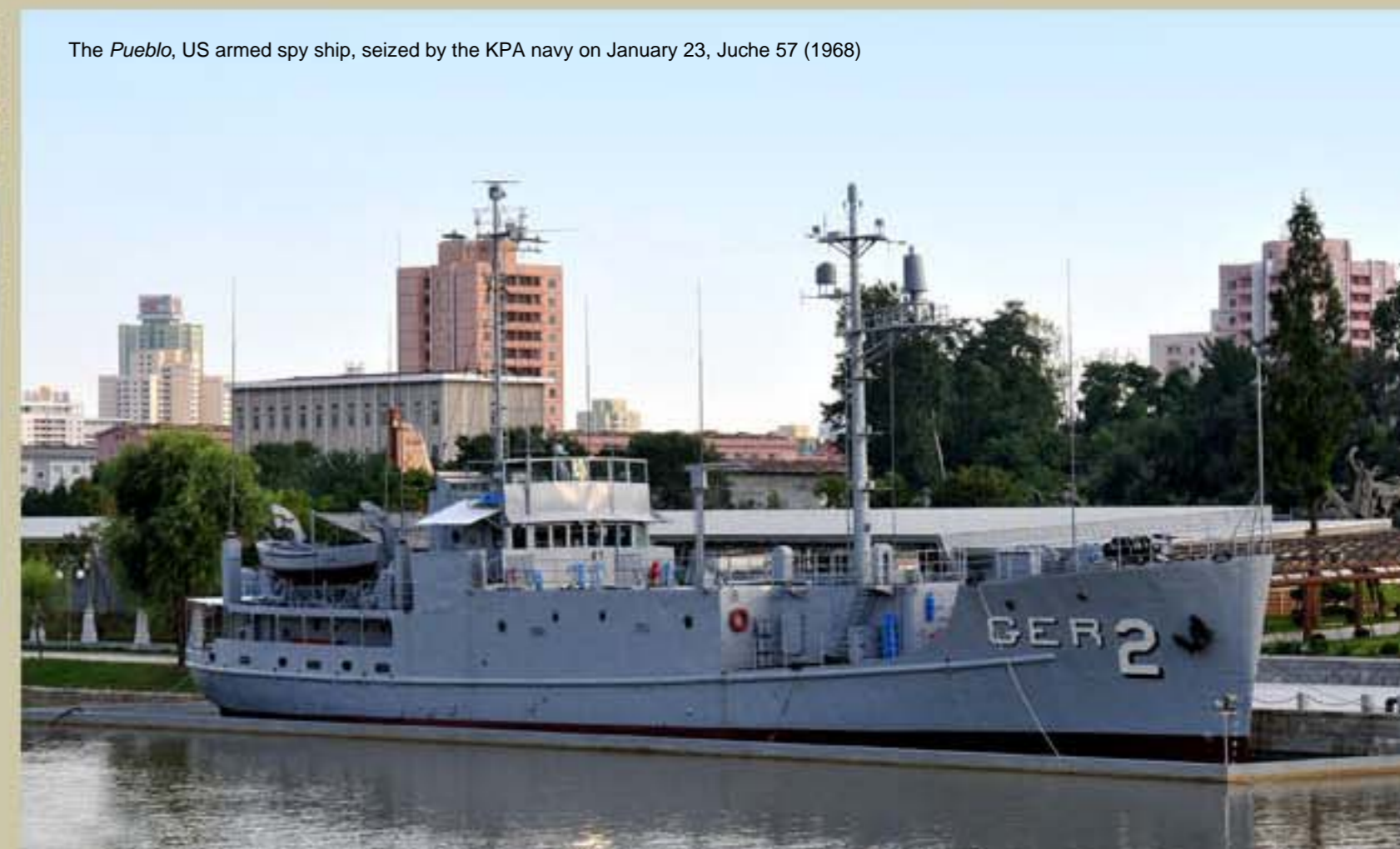
The Pueblo , US armed spy ship, seized by the KPA navy on January 23, Juche 57 (1968)