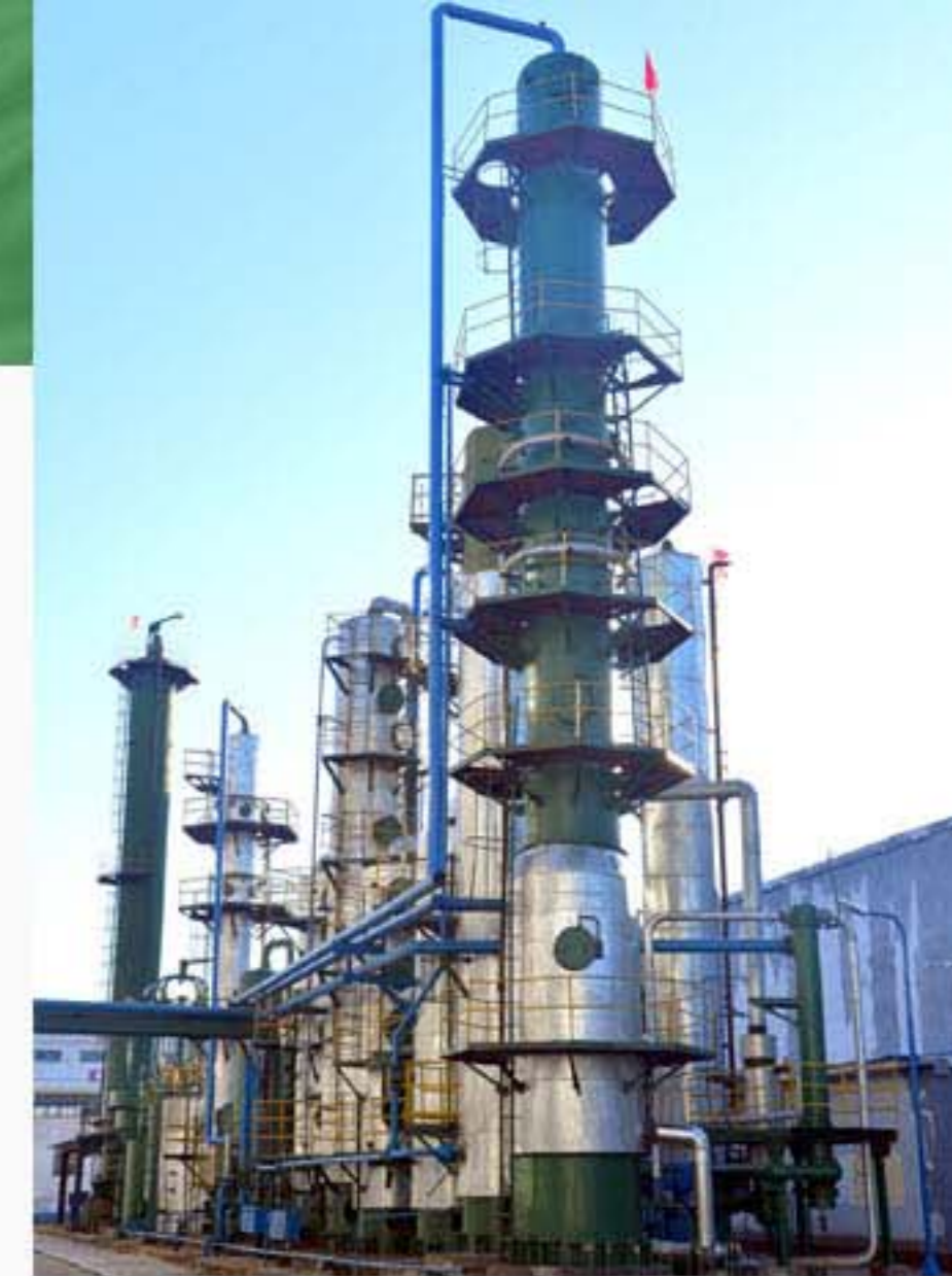
Completion of methanol production line at Hungnam Fertilizer Complex