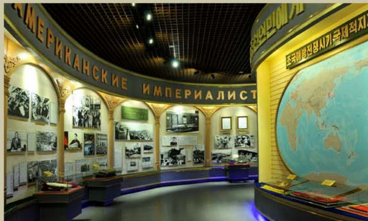
Exhibition hall showing the international support for the fighting Korean army and people