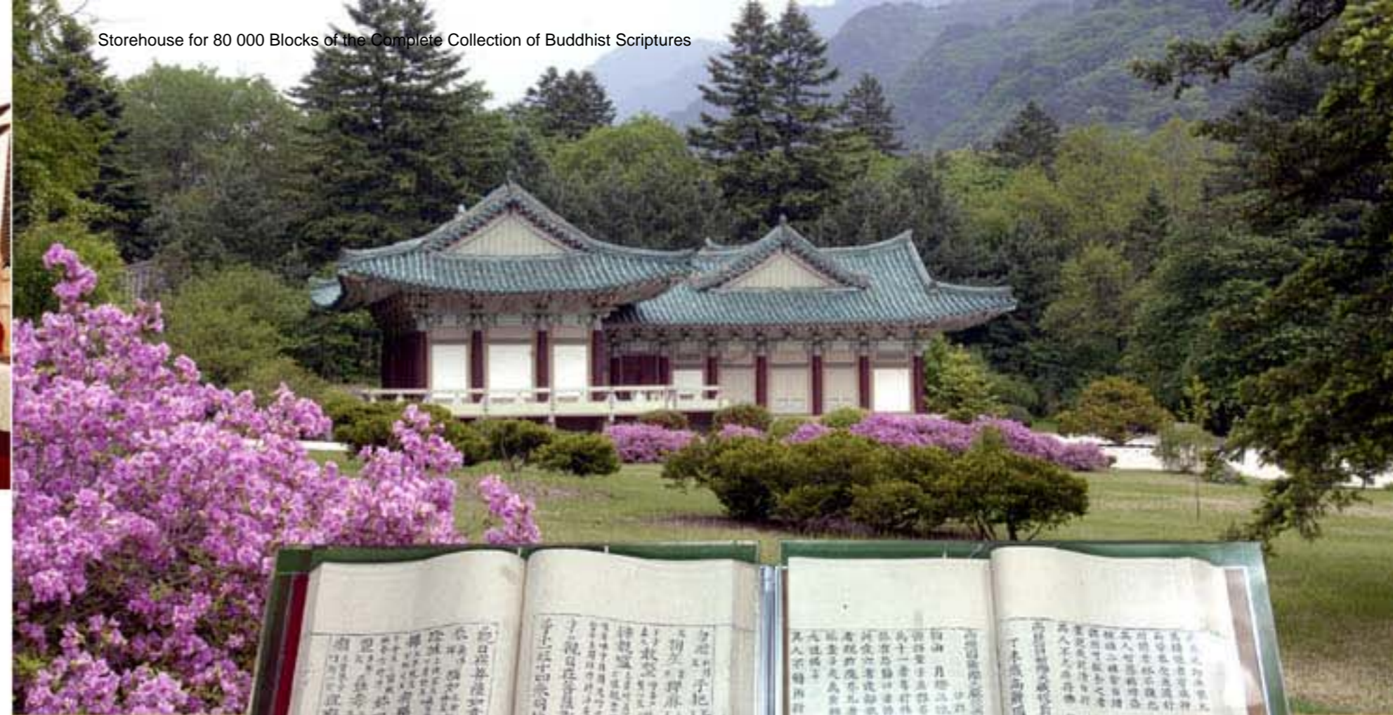
Storehouse for 80 000 Blocks of the Complete Collection of Buddhist Scriptures