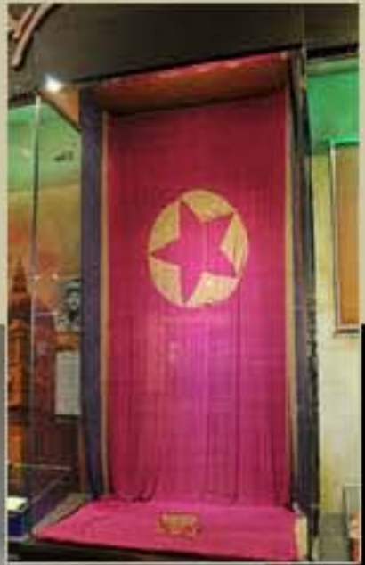
Large cycloramas, relief maps, wax figures, photos and relics showing the heroic feats of the KPA soldiers performed in the war including the battles of liberating Seoul and defending Height 1211